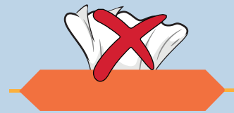
Flushable wet wipes