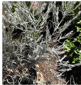
Grey and Silver leaves

In table one below inventory all the plants in the garden based on the leaf categories. The inventory will be an important piece of data to determine if this garden is Waterwise.