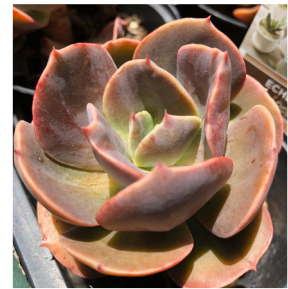
Thick waxy leaves