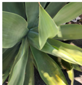
Folded or curled leaves